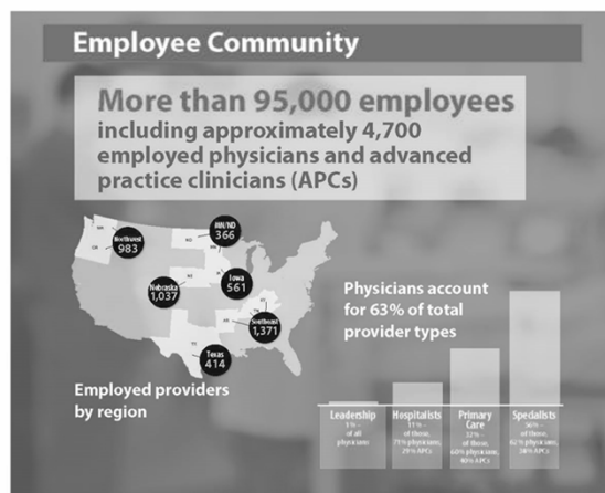
Catholic Health Initiatives | Annual Report Highlights 2017