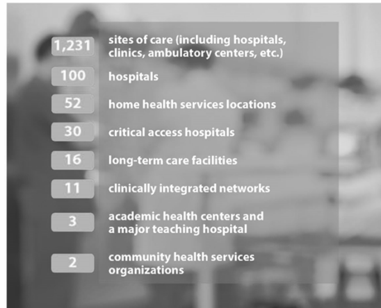
Catholic Health Initiatives | Annual Report Highlights 2017