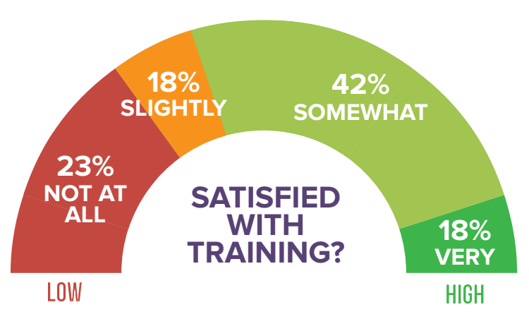
Society of Corporate Compliance & Ethics / corporatecompliance.org