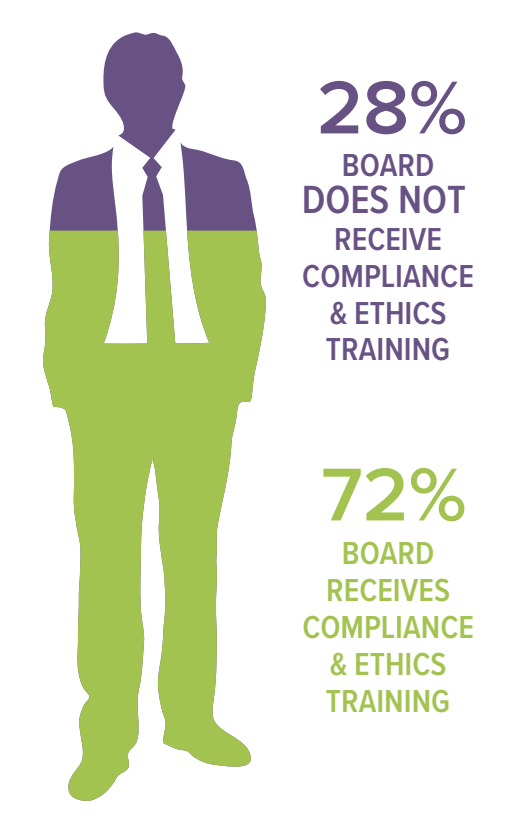
Society of Corporate Compliance & Ethics / corporatecompliance.org

• While board training is the norm, a significant minority of companies do not offer compliance training to board members. Overall 28% report that the board does not receive compliance and ethics-related training, and for publicly traded companies, 34% of respondents indicated no training is provided. This is surprising given the complexity of issues facing public companies.